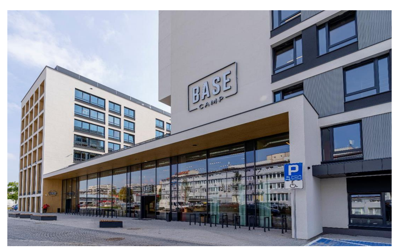
BaseCamp student house in Katowice