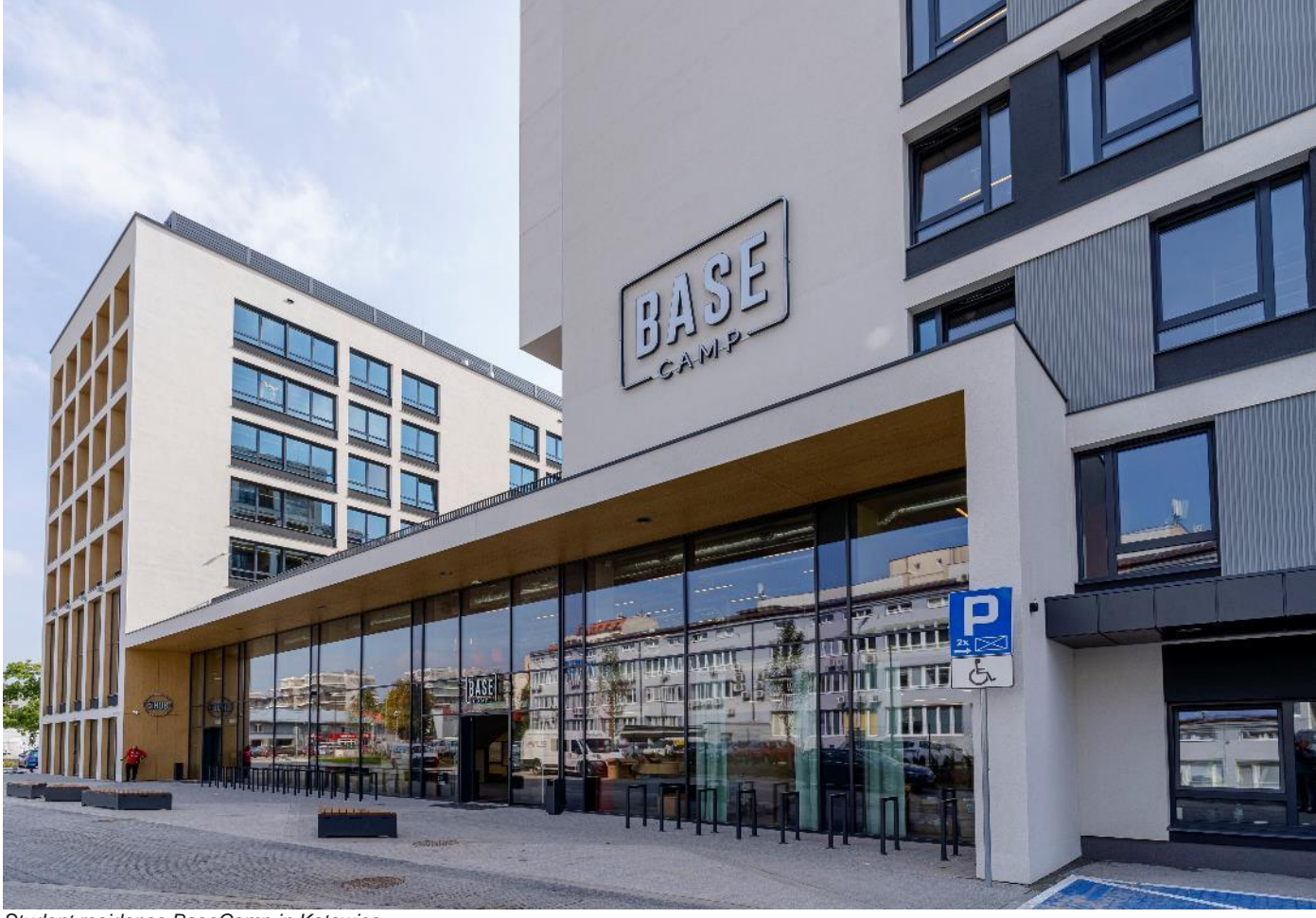
Student residence BaseCamp in Katowice