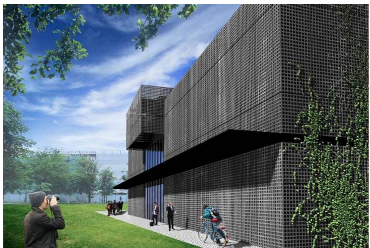
Studenckie Centrum Konstrukcyjne AGH w Krakowie (wizualizacja)

23.12.2013 r. Mostostal Warszawa S.A. and Acciona Construcción S.A. concluded annexes to 3 loan agreements for the total amount of EUR 48,409 thousand (PLN equivalent of 201,815 thousand), in which the terms of repayment of these loans were determined to be such that the loan repayment term was extended indefinitely and Mostostal Warszawa S.A. would decide on their repayment. In accordance with IAS 32 Mostostal Warszawa presented these loans in equity.