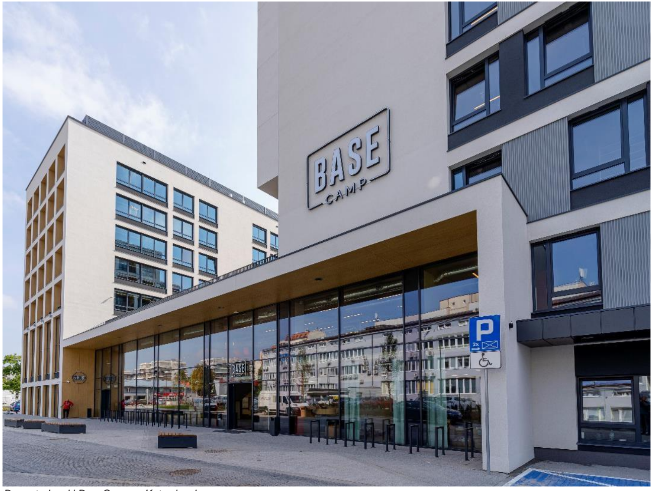
Dom studencki BaseCamp w Katowicach