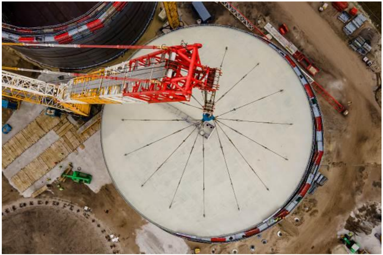
Budowa zbiomików PERN w Nowej Wsi Wielkiej