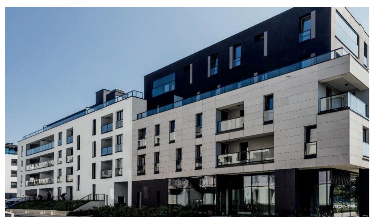
Acciona Wilanów B6

The value of short-term trade liabilities as at 31.03.2022 amounted to PLN 215,867 thousand and increased by PLN 24,970 thousand compared to 31.12.2021.