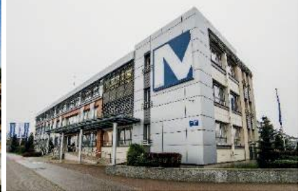
Siedziba AMK Kraków S.A