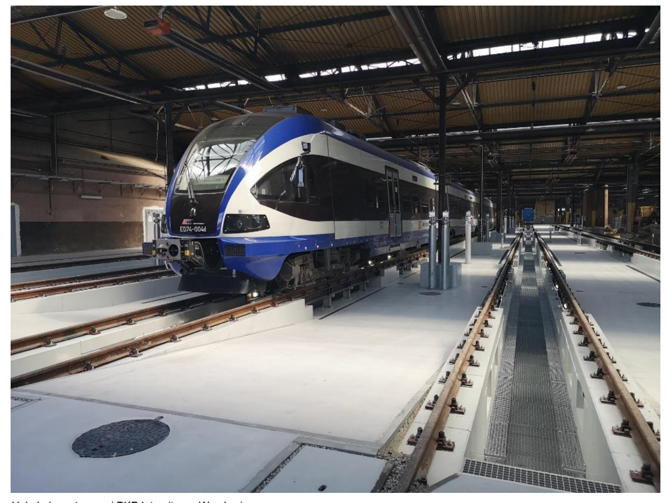
Hala Lokomotywowni PKP Intercity we Wrocławiu

In the period from 15.04.2022, i.e. the date of publication of the report for 2021, to 23.05.2022, there were no changes in the ownership of shares of Mostostal Warszawa S.A. by managing and supervising persons.