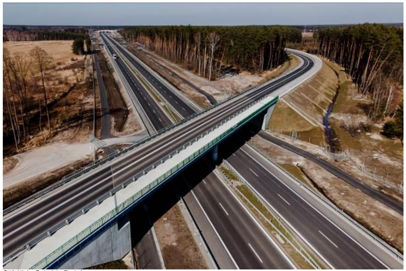
S19 Nisko Południe-Podgórze